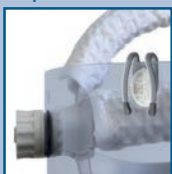
Lead mask protection